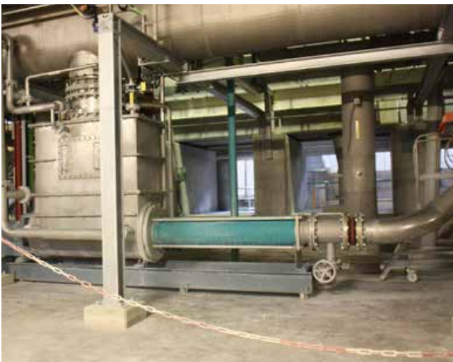
TORNADO® T1 conveying kaolin slurry

The self-priming TORNADO® pump operates via displacement, transporting the conveyor medium continuously from the suction to the pressure side using two intermeshing rotors. Almost all types of media can be transported smoothly in this way, from low-viscosity and high-viscosity materials such as thixotropic or dilatant substances to sticky and non-sticky or shear-sensitive materials. The pump also handles particle sizes of up to 70 mm with ease. The transported volume can be regulated easily via the rotation speed. Volumes of up to 1,000 m 3 /h can be achieved depending on size.