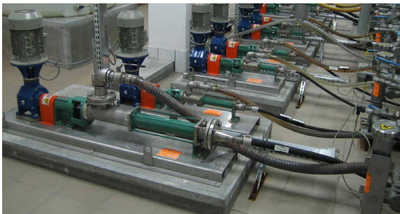
NEMO® pumps are conveying latex dispersions

In the petrochemical industry aromatic hydrocarbons contained in the pumped fluids cause problems quite often because such substances generate swelling of stators and joint seals. The use of suitable elastomers or stators made from solid materials in NEMO® progressing cavity pumps prevents swelling and guarantees the operational reliability of your plant.