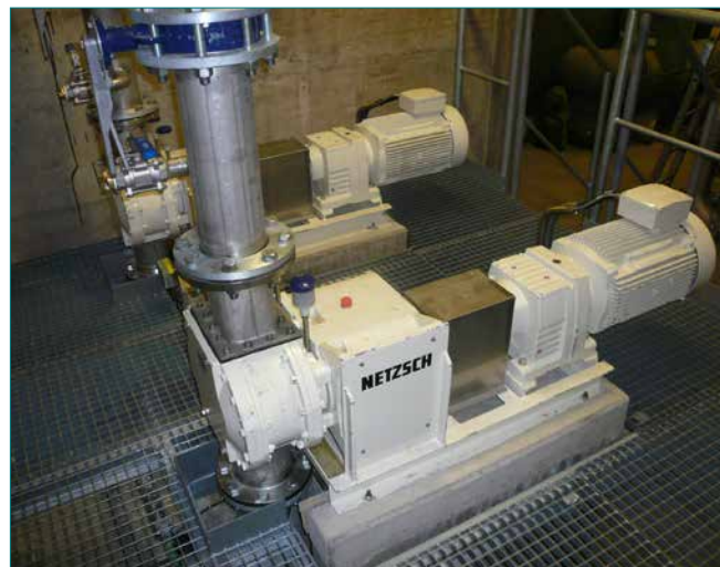
NEMO® pumps waste paper